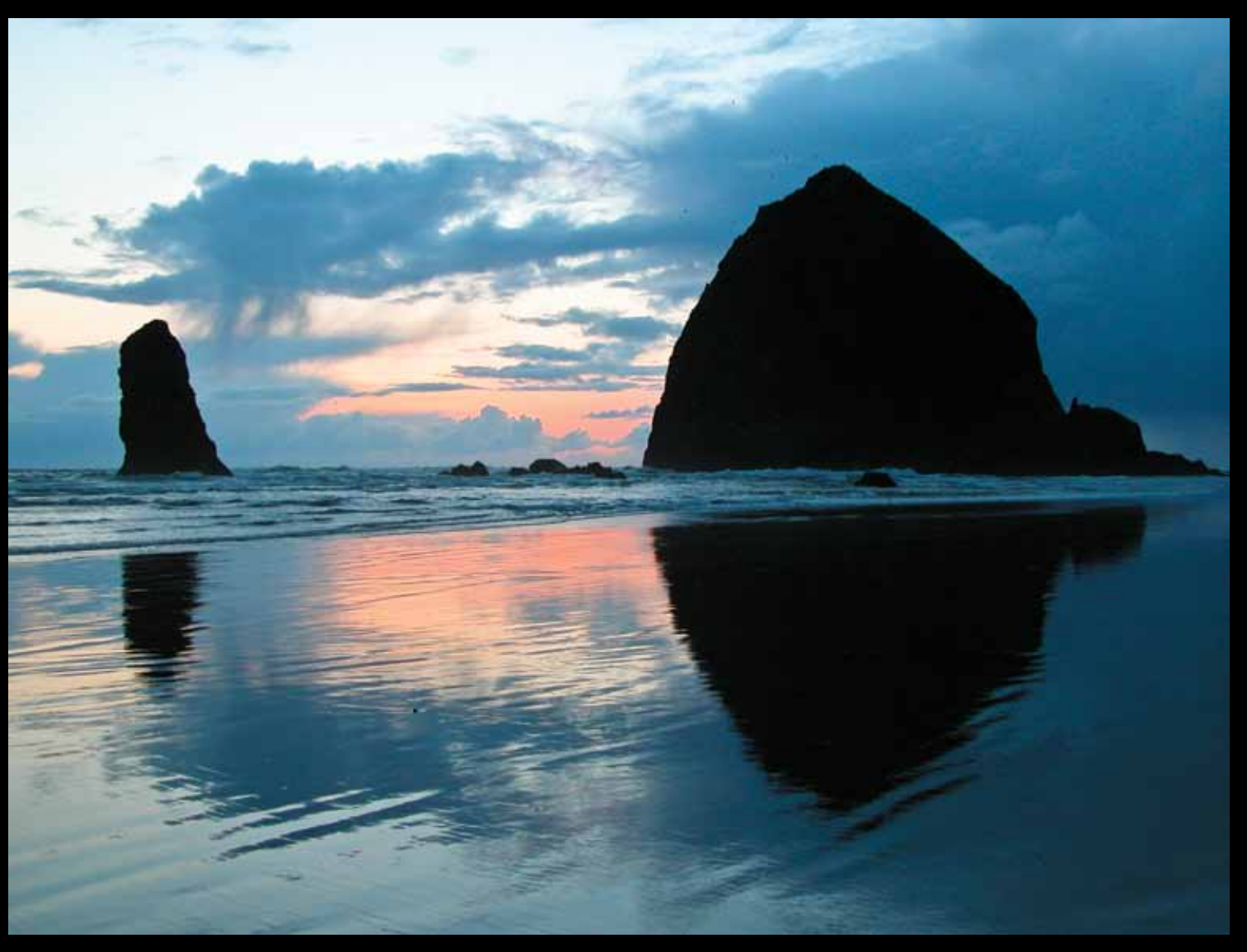
Haystack Rock Cannon Beach, Oregon